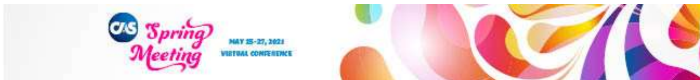
Exhibit Hall Ad ($1,000) includes:

Take advantage of this opportunity to promote your business, networking events, or highlight new products. Throughout the event, we will be showcasing a video in the exhibit hall with ads from sponsors, promote luncheons/receptions, roundtables, etc.