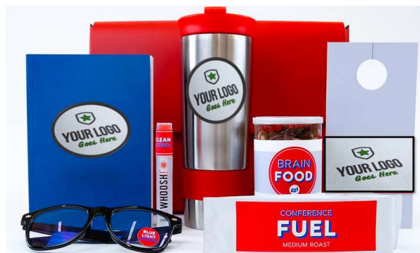
Example image from vendor above.

Get in front of attendees by adding a branded item or brochure to a package sent to all attendees prior to the seminar. CAS will ask all attendees to sign up to receive a registration box in the mail. This box will be sent to the first 100 registrants and will include snacks and CAS giveaways.